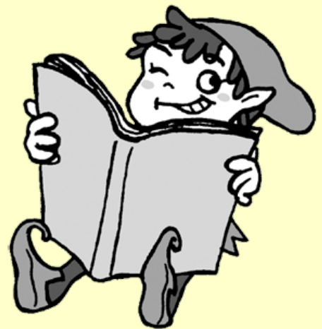
"Learning for Smarties"

Once you know the content or dance step, etc. quite well, practice it every day or 2 to IMProve. Then as you are feeling more comfortable and know it even better, a week or 2 until your next encounter is fine.